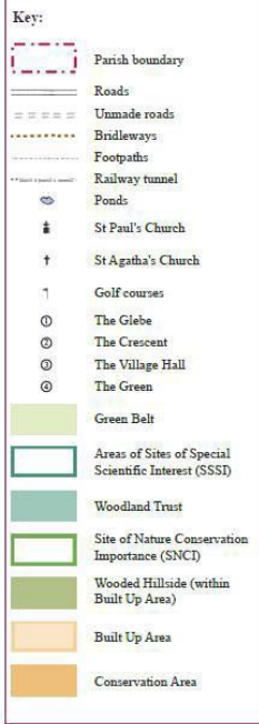
Map of Woldingham Parish